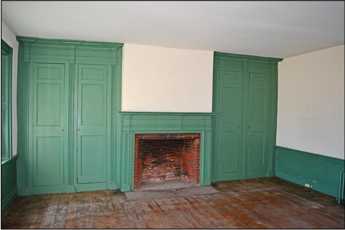
Above: South first floor room in the house; Below: North first floor room