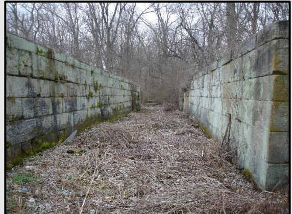
Lock at Lockbourne

“The Columbus Canal: This branch of canal was over four years constructing. The heaviest jobs were the canal dam across the Scioto and the Columbus locks...and the eight locks at Lockbourne. The first mile from the Scioto was excavated by the Penitentiary convicts under guards. Such men were selected by the keeper as would have least inducement to break away; and they generally received a remission of part of their sentence for faithful service. On the 23d of September, 1831, the first boat arrived at Columbus by way of the canal. About 8:00 o’clock of the evening the firing of cannon announced the approach of the Governor Brown , a canal boat launched in Circleville a few days previous, and neatly fitted up for an excursion of pleasure to this place, several of the most respectable citizens of Pickaway County being on board as passengers.” — History of Franklin County , William T. Martin, 1858.