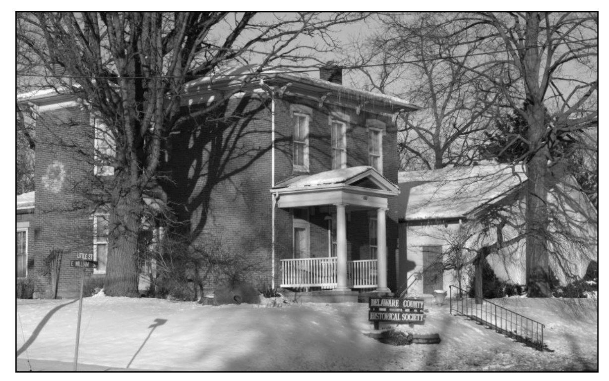
The Cryder Historical Center includes the Nash House, left, and the library/annex building