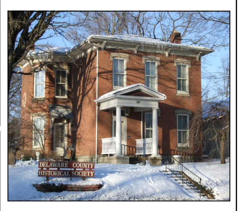
The Nash House