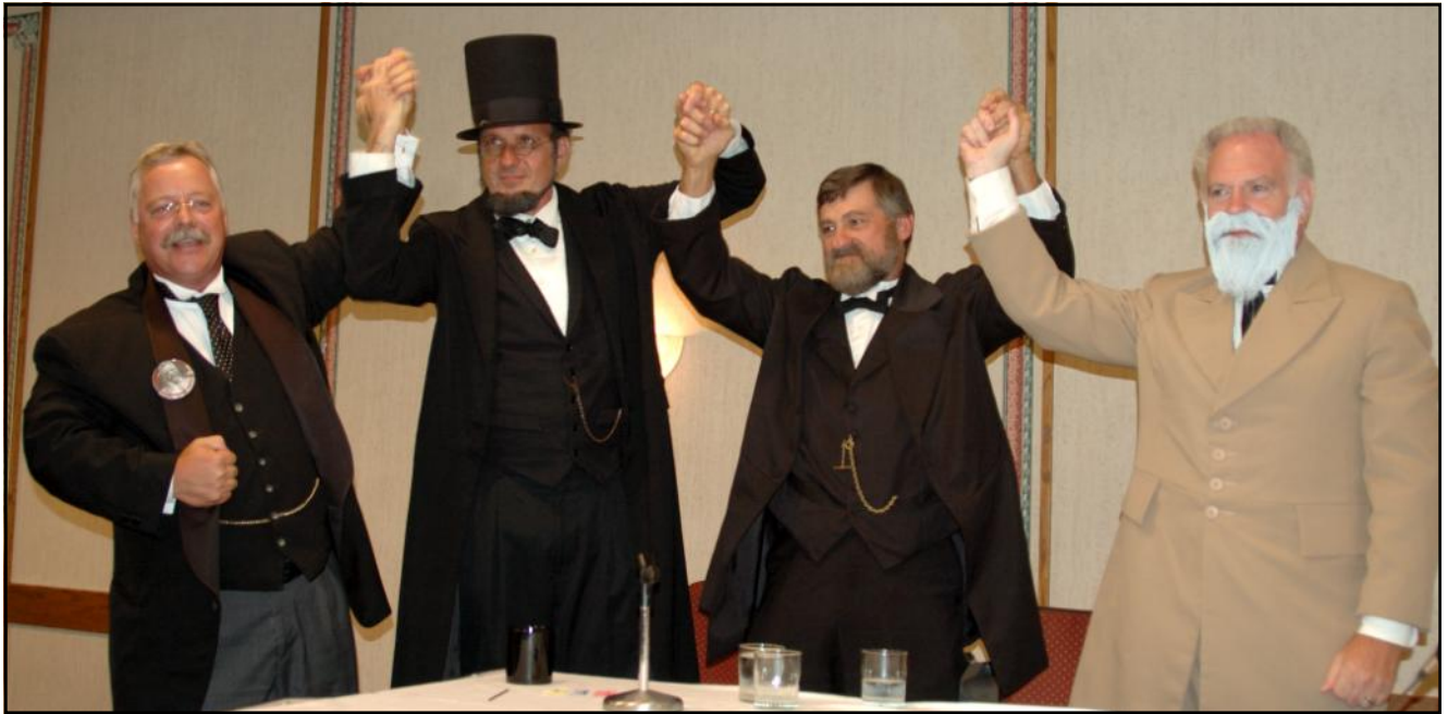
From left, Theodore Roosevelt, Abraham Lincoln, Ulysses S. Grant, and Rutherford B. Hayes (or actors portraying them) highlighted the convention.