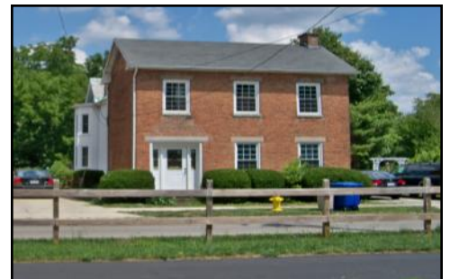
The Rausher Home Photos on pages 4 and 5 by Sue Bauer