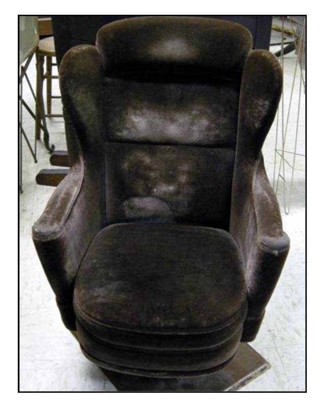
Left and Above: Items from C, D & M Railway