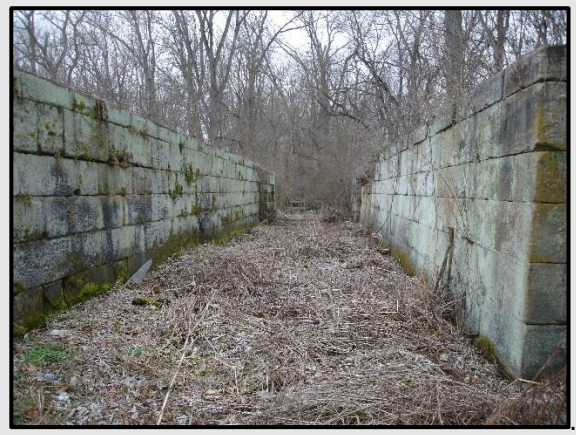
Aqueduct at Circleville