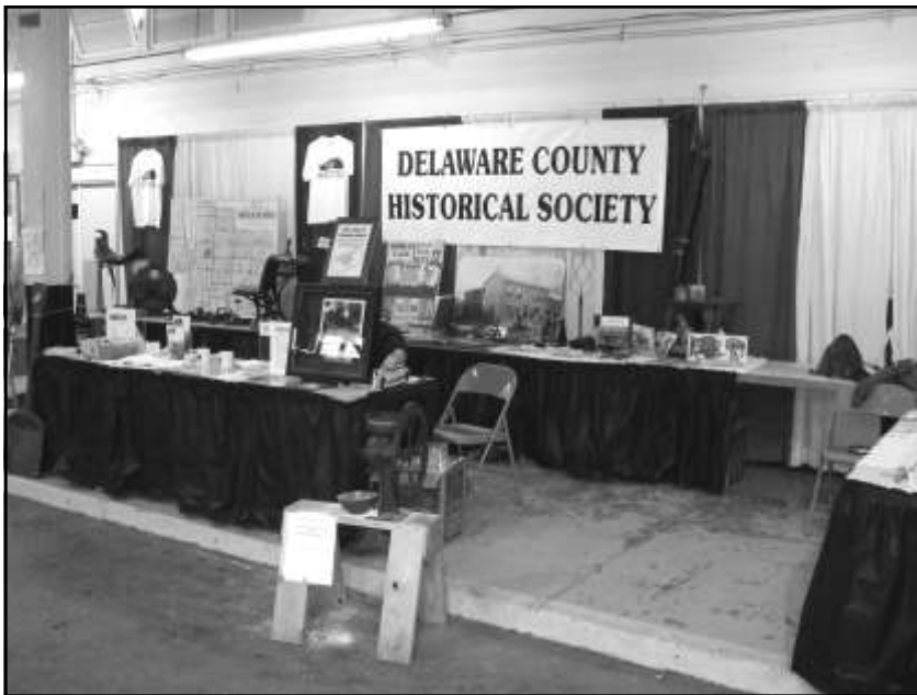
Above: The Society once again had a booth in the Coliseum at the Fairgrounds during the Delaware County Fair, featuring many photographs and interesting items from Delaware County's past.