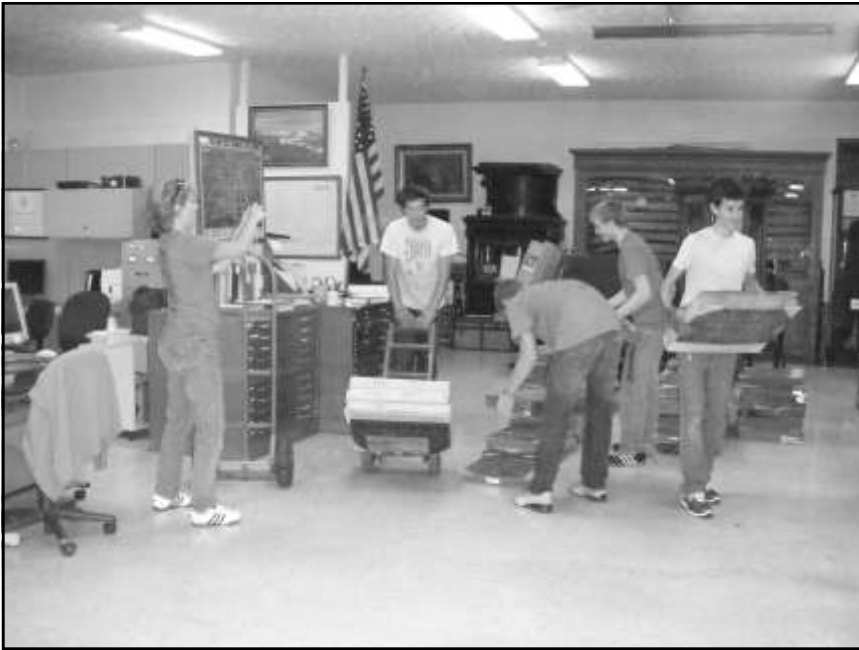
Above and Right: Students from Delaware Christian School move bound volumes of the Delaware Gazette into the Library at the Cryder Historical Center.