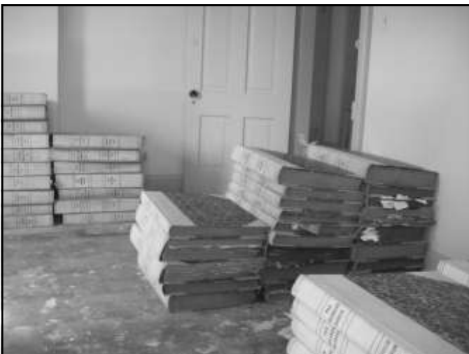
Left: Bound volumes ready to be removed from the former offices of the Delaware Gazette .