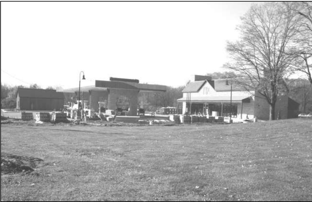
Turkey Hill store as it appeared in late October 2011.