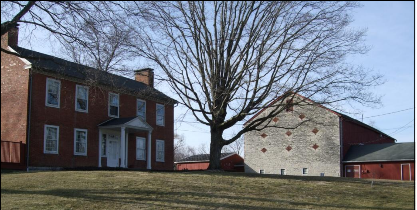
The Forrest Meeker Homestead