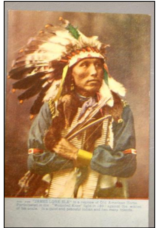
Examples of Postcards