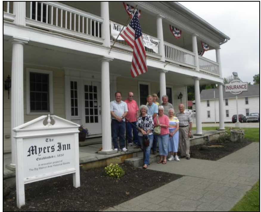
The tour group in front of Myers Inn in Sunbury

On August 23, the Society hosted tours of the Meeker House, Oberlander Barn and the Nash House for our guests from the Big Walnut, Powell-Liberty and Radnor historical societies.