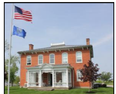
Some of the stops shown at the fair. From left, Delhi Tavern, Detweiler Tavern, Gooding Tavern