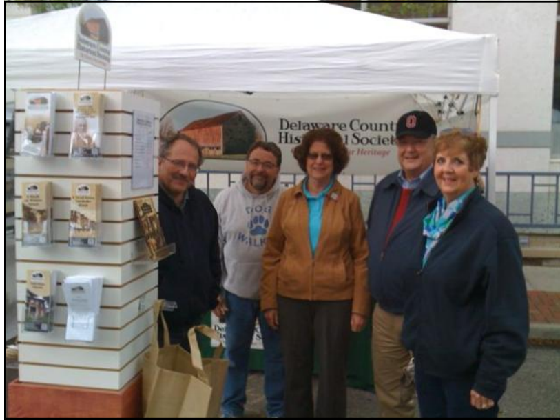
Back in May, the Society again had a booth at the Arts Festival and put the spotlight on some local artists of the previous century.