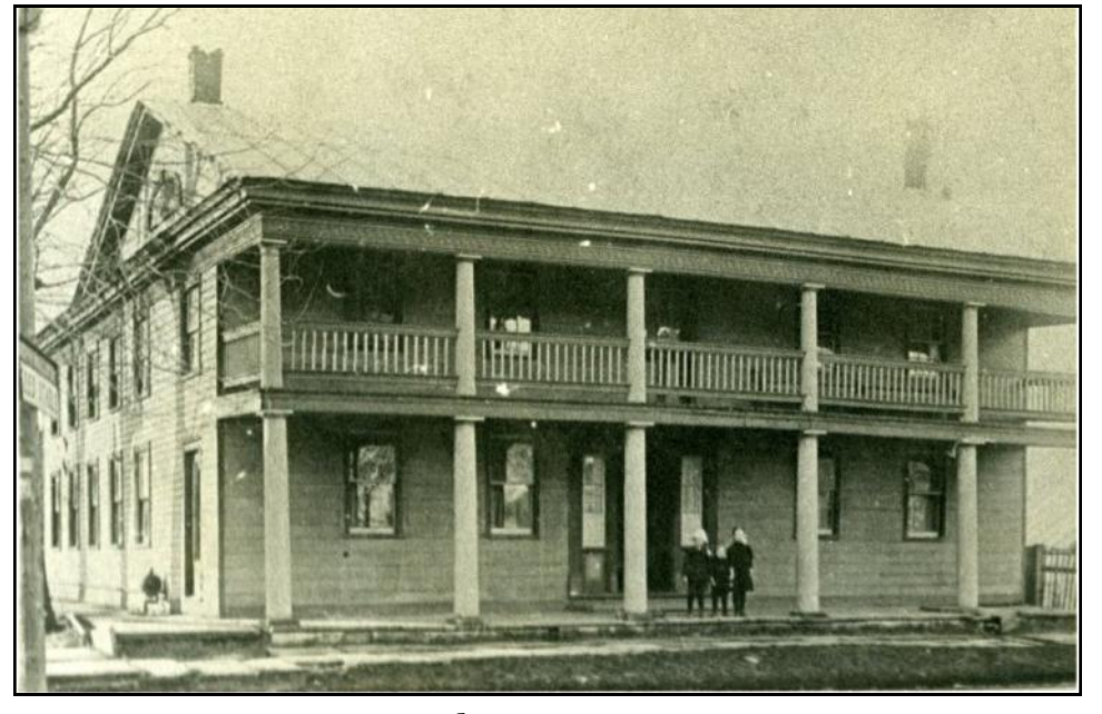
The Myers Inn