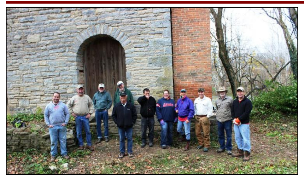
Volunteers at the mill after a good day's work

silt from the river. The stone arches are still visible several feet above the silt. Due to the lack of archeological findings at Bieber Mill, it is possible that underneath the years of silted debris in the basement foundation there may be remnants of an old wooden waterwheel, or even more likely, turbines. What an amazing find that would be!