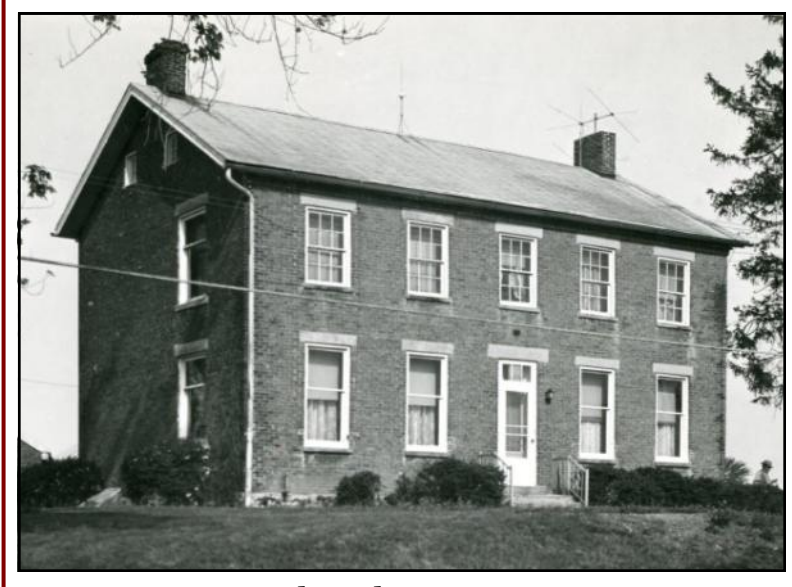
The Baker Tavern

The most noted is the Myers Inn in Sunbury. The