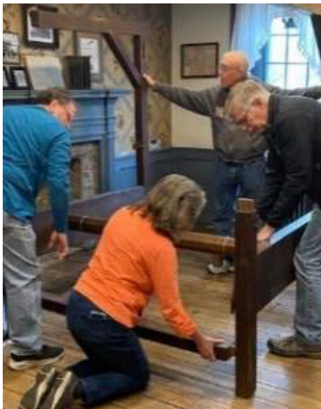
Volunteers assemble our pre-Civil War Barn Loom.