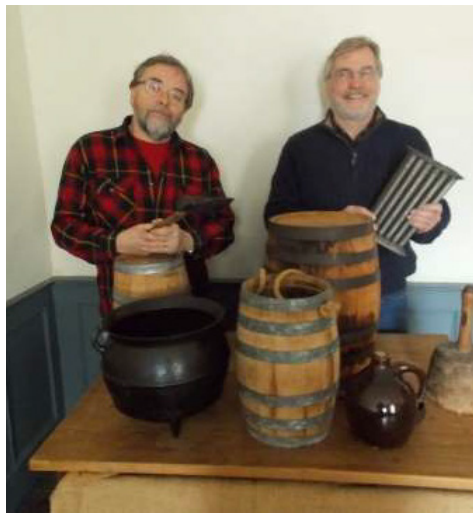
Volunteers begin assembling artifacts for our new exhibit.