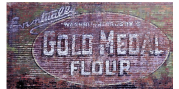
Gold Medal ghost sign - pinterest.com

The Gold Medal flour brand was launched after 1880 when Washburn-Crosby Company won gold, silver and bronze medals at the Millers' International Exhibition in Cincinnati. General Mills, Inc. acquired the Gold Medal brand in 1928 when Washburn-Crosby merged with 28 other mills. (wiki/General_Mills).