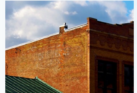
Gold Medal ghost sign – 2015

The Gold Medal flour brand was launched after 1880 when Washburn-Crosby Company won gold, silver and bronze medals at the Millers' International Exhibition in Cincinnati. General Mills, Inc. acquired the Gold Medal brand in 1928 when Washburn-Crosby merged with 28 other mills. (wiki/General_Mills).