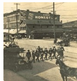
"Chew Honest Scrap" - circa 1910-1920