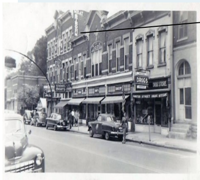
Strohm Meat Market in the 1950s

Strohm Meat Market occupied 12 West Winter St. from 1908 to 1966. Bun's Bakery and Restaurant was at 10 West Winter St. from 1889 to 2002, then moved to 12 West Winter St. after a fire in 2002.