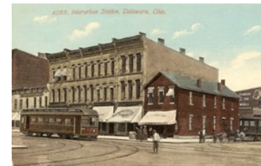
"Standard of the World" ghost sign circa 1900

Bull Durham tobacco was manufactured by W. T. Blackwell and Company in Durham, North Carolina. Blackwell was among the first companies to implement a large-scale advertising campaign.