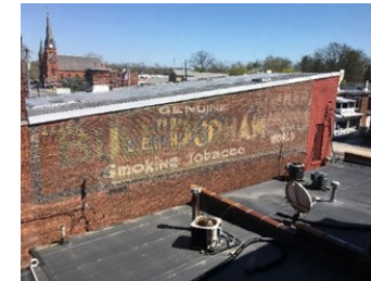
Bull Durham ghost sign - 2018

There were likely several generations of signs painted on this wall. Beside "Genuine Bull Durham", you may be able to discern parts of "Coca Cola" and "Sold Everywhere 5¢".