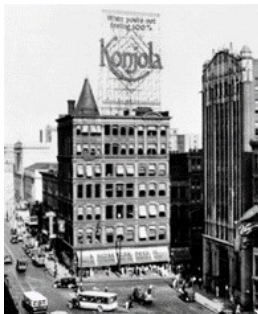
Mosby's huge advertising sign at the southeast corner of 5th and Main in Cincinnati

Joyner's Drug Store occupied this building by 1880 and continued to the 1920s. Kinsey's Drug Company followed, then Del RX Pharmacy until 1991.