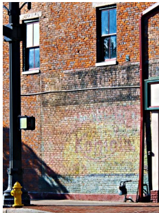
Konjola ghost sign - 2018

This ghost sign had been covered by stucco for years. It was uncovered when the building underwent renovation in 2014.