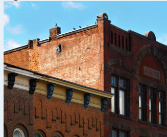
Bodurtha ghost sign - 2015

57½ N. Sandusky St. – south facing wall of the Steeves Block