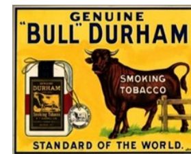
"Bull" Durham tobacco ad

The first business documented in city directories at 9 East William St. was the Delaware Herald newspaper, from approximately 1890 to 1900 or so. From 1930 until roughly 2000, Independent Print Shop made its home here. Today it is the Upper Cut Barber Shop.