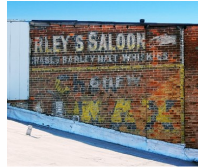
Kurrley's Saloon ghost sign – 2015

Victor E. Kurrley operated a saloon and pool room at 9 North Sandusky St. from about 1897 to 1900. "Nichols & Briner" ran a saloon at the same location from 1901 to 1910, followed by a café.