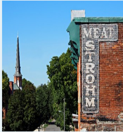
Strohm Meat ghost sign - 2015

Strohm Meat Market occupied 12 West Winter St. from 1908 to 1966. Bun's Bakery and Restaurant was at 10 West Winter St. from 1889 to 2002, then moved to 12 West Winter St. after a fire in 2002.