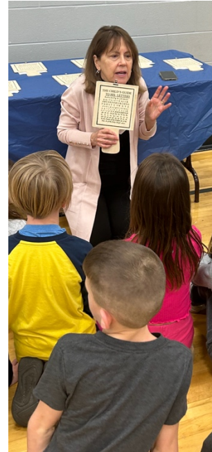
Learning to read from a Hornbook